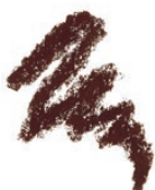
MEDIUM V Medium / dark brown