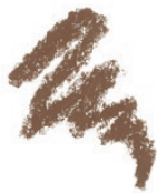
LIGHT V Light brown