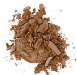
MIAMI BEACH ✓

Apply with the Bronzer Brush to create an all over glow or use the Blush Brush to contour the face by defining underneath the cheek bones, the sides of the nose and around the hairline.