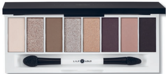
PHOTO FINISH Matte, creamy nude GOLD MEDAL Shimmer, light gold

FUELLED Shimmer, sparkle beige CARBON Matte, dark grey