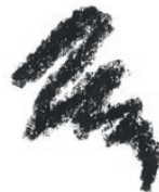
BLACK ✓ Matte, black