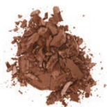
MONTEGO BAY ✓