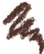
BROWN ✓ Matte, chocolate brown

Create a slick flick along the upper lash line during the day, and intensify the look for the evening by continuing the line along the lower lash line.