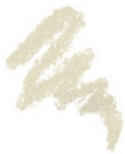
HIGHLIGHTER V Light gold